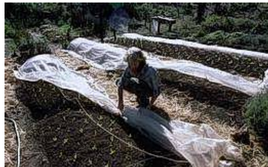
Cover young plants to protect them from insects that spread the virus.