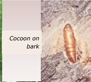
Cocoon on bark