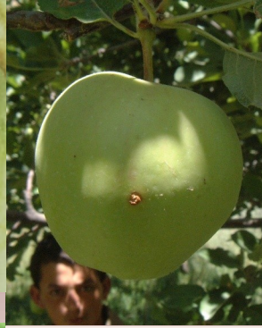
Codling 'sting' on Fruit