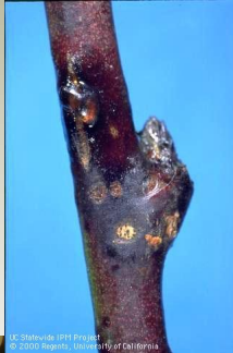
Peach twig with dead bud, gumming, and shot hole lesions