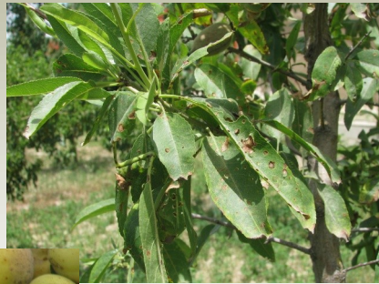
Almond in Balkh showing symptoms of shot hole on